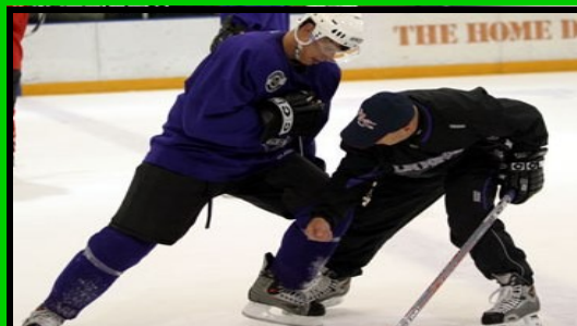
ABOVE: TEACHING NHL SUPERSTAR SIDNEY CROSBY

HURRY & SIGN-UP...THIS PROGRAM STARTS SOON! SKATING COACH TO THE NHL STARS!!